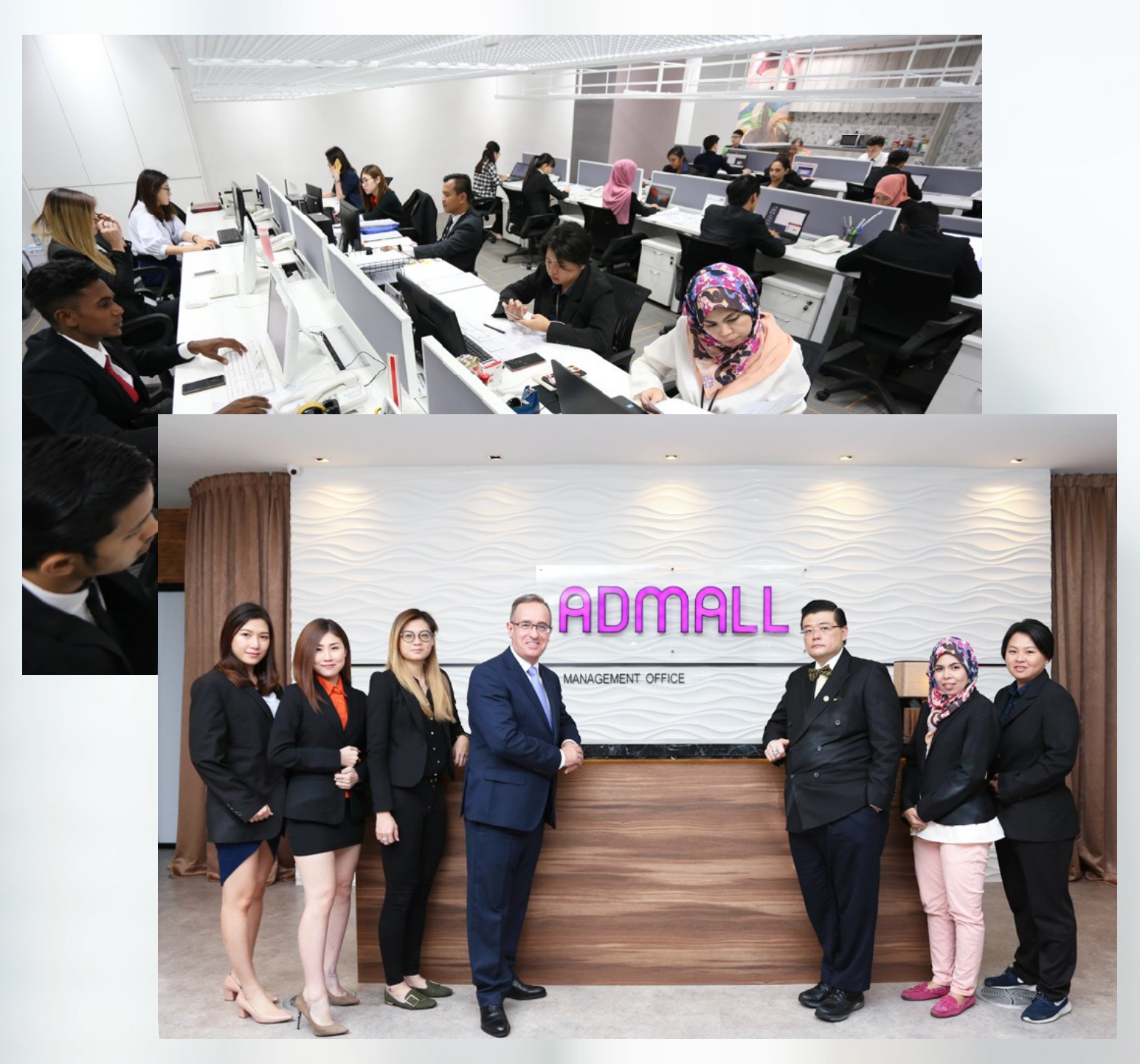
The Admall business model ensures attractive returns to our investors.

Headquartered in Malaysia, Admall Sdn Bhd has grown a community covering South East Asia, China, as well as Hong Kong, Taiwan and Korea. Future plans include Europe, Middle East and United States. The Admall business model ensures attractive returns to our investors.